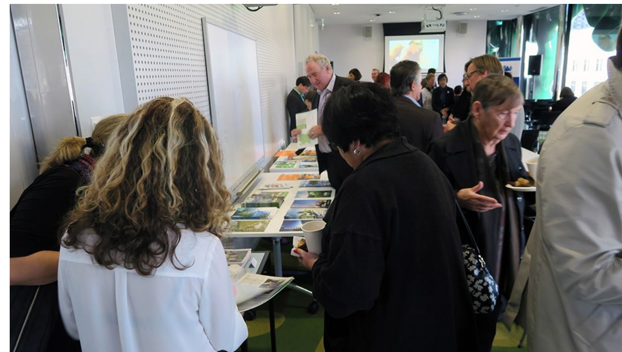
Photo bottom right page SAAA Conference, 22 May 2017, EU Centre at RMIT, Melbourne