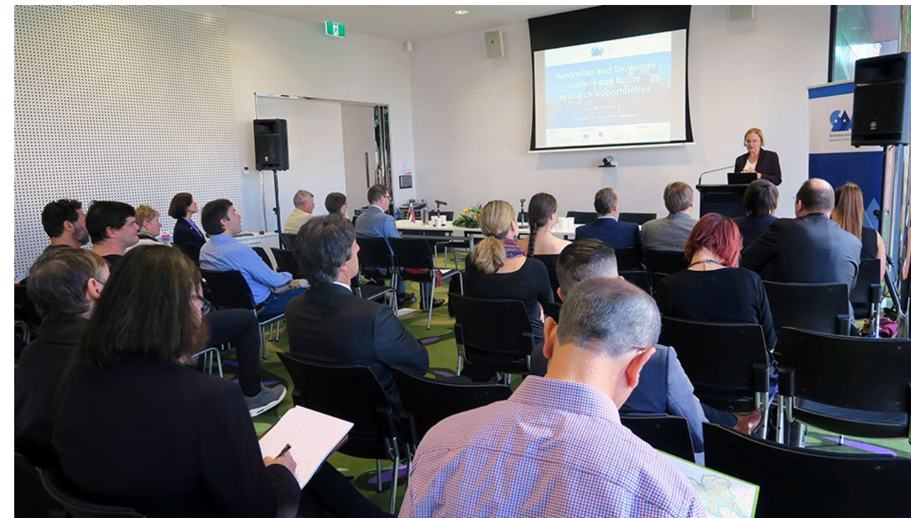
Photo top right page SAAA Conference, 22 May 2017, EU Centre at RMIT, Melbourne